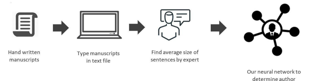
Fig. 1 extracting text from manuscripts and data processing procedure